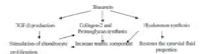
Fig.2: Mechanism of action of diacerein

Anabolic effects – diacerein has beneficial effects on the anabolic processes that occur in the cartilage. It increases the production of TGF-β that triggers chondrocytes proliferation and stimulates the production of collagen – 2, proteoglycan and hyaluronan. (Fig 2)