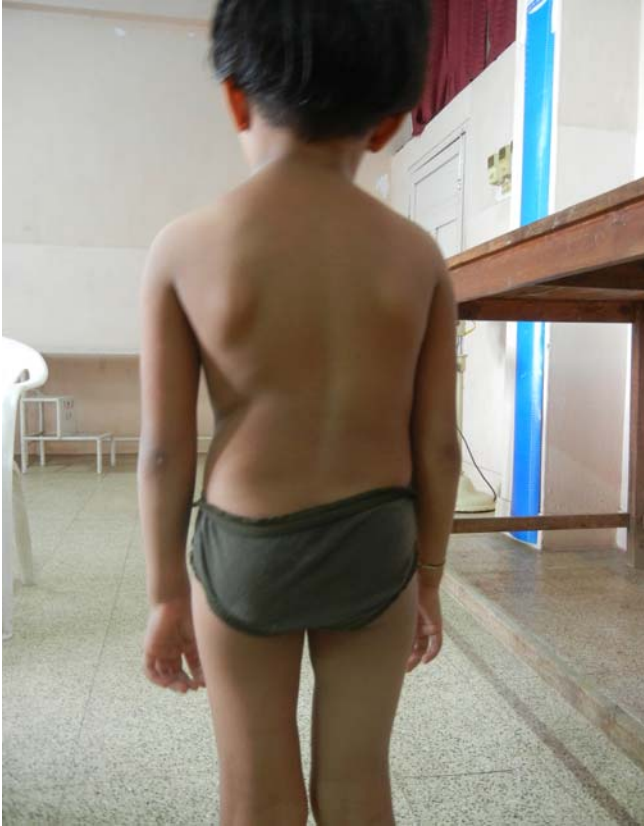
Fig 1- Thoracolumbar Scoliosis

power. Left lower limb and both upper limbs showed grade 5 power. Deep tendon reflexes were normally elicitable from all four limbs, except right ankle jerk which was sluggish. Plantar reflex was not elicitable on right side. Mild wasting of hypothenar muscles and mild clubbing were noticed on both hands (Fig 2). Grip was moderate and appropriate for her age. There were no sensory findings in all four limbs or trunk. Cranial nerves and cerebellar function tests were within normal limits.