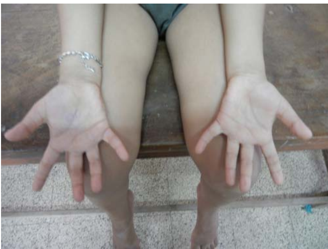
Fig 2- Wasting of Hypothenar Muscle

Nerve conduction study was performed in all four limbs. CMAP and SNAP were recorded from median, ulnar, radial, peroneal, tibial and sural nerves. Bilateral median CMAP and SNAP were found to be within normal limits. Low amplitude CMAPs were recorded from both ulnar nerves suggestive of an axonal loss pattern, whereas corresponding SNAPs were within normal limits. Both tibial CMAPs were within normal limits. Low amplitude axonal loss pattern was recorded from both peroneal nerve CMAPs, with normal SNAPs. Sural SNAP also recorded normally. F waves were either absent or latency prolonged from all motor nerves suggested. The whole NCS picture pointed towards an anterior horn cell involvement, and further work up with MRI was planned. X-ray of spine (Fig 3) showed thoracolumbar scoliosis towards right with apex at T12 and absent rotation. Cobb's angle measured was 30 degrees. No other abnormalities were detected.